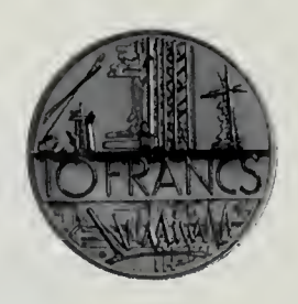
Lot No. 2722

2722 1980. 5 Francs, KM P667, mintage 213 pieces; 10 Francs, KM P670, mintage 157 pieces. The first is a satin finish Proof, the second is Brilliant Proof with beautifully mirrored fields. 78 Grams. 2 pieces.